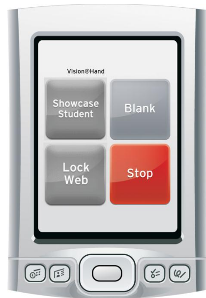
Vision@Hand (PDA not included)

Vision@Hand provides a simple, easy-to-read interface that allows you to see what actions are currently in use. It can be used with a wide variety of web browsers that allow the user to navigate to the teacher's computer from a PDA or other mobile device.