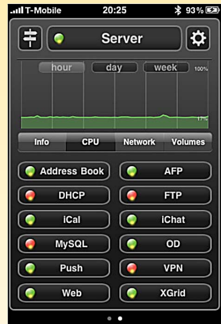
Figure 1. This remote server administration application is sold in iTunes store. 4

Another strong use case for remote administration security is IT staff logging in with administrative privileges when they are off premises, even from smart phones, to manage or troubleshoot servers and end point systems inside the organization. Figure 1 illustrates one application for the iPhone that can be used for these purposes.